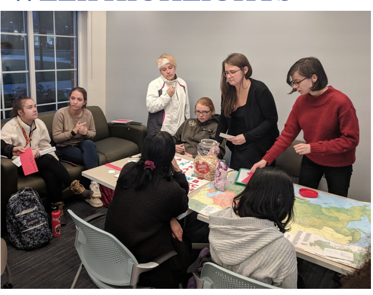
Learn to Write Your Name in Russian