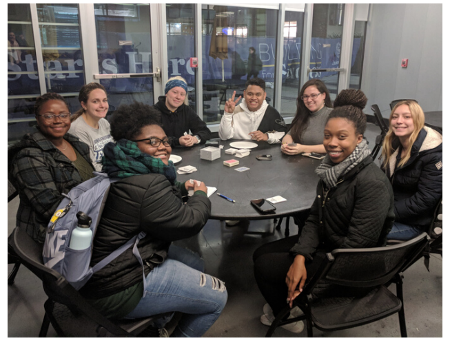
ISA International Mixer